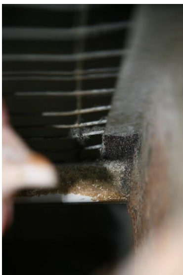
Fig.3. Behavioral adaptation of D. gallinae to the application of SiO 2 formulations.