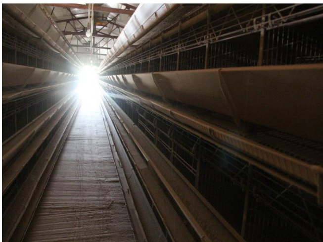
Fig. 5. An example of a prepared facility by combined method, application of the powder and liquid forms of the \text{SiO}_2 formulations.