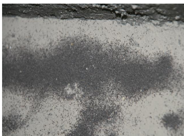
Fig 2. Detail from a cage without considerable effect of diatomaceous earth on D. gallinae .

Based on the results of biological efficacy, we have conducted a selection of formulations for clinical examination. We have singled out characteristic examples